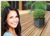
Decking & fencing

Get information from your local dealer or an elka® sales adviser about the advantages of our products. It's worth your while!