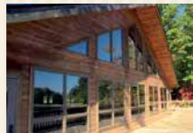
Facade profiles & planed products