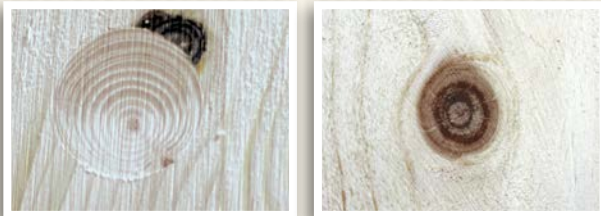
Conventional natural knothole patch vita natural knothole patch

Selected timbers in spruce and douglas fir make the panels beautifully shaped unique pieces. The panel surface is perfected with high-quality elka natural knothole patches .