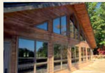
Facade profiles & planed products