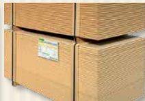
Particleboard & lightweight panels