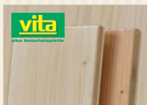
Natural wood panels