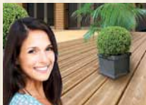
Decking & fencing

Get information from your local dealer or an elka® sales adviser about the advantages of our products. It's worth your while!